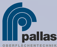
Pallas Oberflächentechnik GmbH & Co KG Würselen, Germany